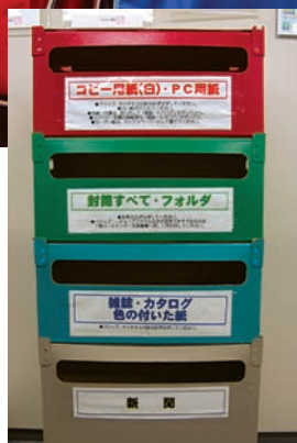
Recycle box installed within the headquarters