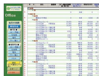
"Office Clean" activity database