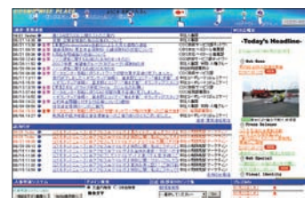
COSMO WISE PLACE internal portal site