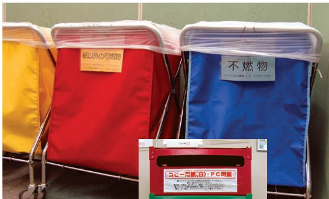
Clean corner within the headquarters

Reducing environmental impacts and creating a sustainable society are issues that concern everyone. In accordance with this thinking, we are steadily expanding our environmental preservation activities.