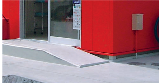
Wheelchair access ramp

WEB Detailed data Environmental Management Point (EM Point) http://www.cosmo-oil.co.jp/eng/sustainable/07/env/management.html